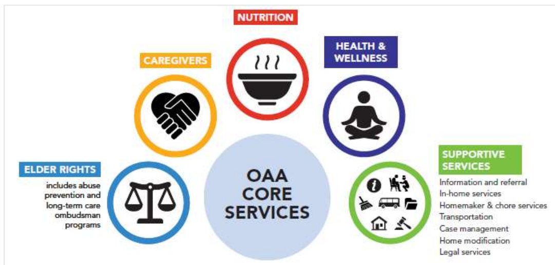
Figure 3: Core OAA Services Offered by LADOA